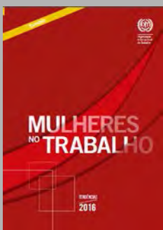
Women at Work Trends 2016

The report "Women at Work: Trends 2016" examined data of up to 178 countries and concluded that inequality among men and women persists in a wide spectrum of the global job market. Besides, the report shows that women achieved, over the last two decades, significant progress in education, which does not mean comparable improvements in their job positions.