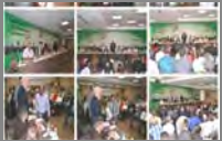
Check the pictures of the