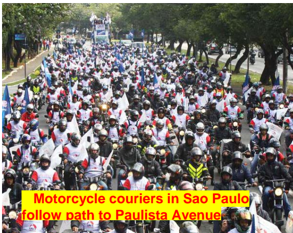
Motorcycle couriers in Sao Paulo follow path to Paulista Avenue

If this does not happen, the trade union is already articulating a National Day of Standstill all over the country, which is supposed to take place on August 30.