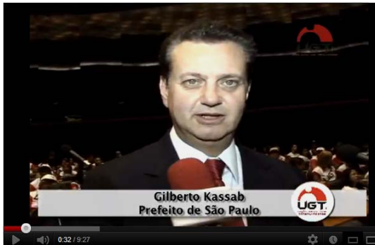
Gilberto Kassab, mayor of Sao Paulo, participated in tribute to UGT (watch the video)

Created in 2007, from a merge of three trade union centrals, UGT aggregates more than 1,5 thousand trade union centrals and represents nearly 7 million workers from several sectors of economy, either in the rural and urban areas.