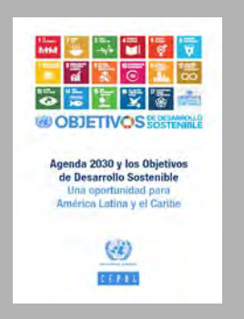
Agenda 2030 y los Objetivos de Desarrollo Sostenible

The goals and targets will stimulate action for the next 15 years in areas of crucial importance to human kind and to the planet.