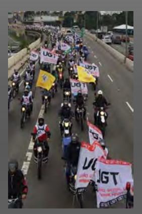
UGT mobilizes workers of diverse categories