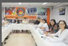
Fórum das Mulheres