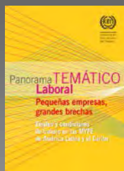
Pequeñas empresas, grandes brechas